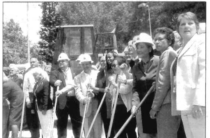
Dignitaries spoke, and the Azusa High School Marching Band and Boy Scout Color Guard performed.