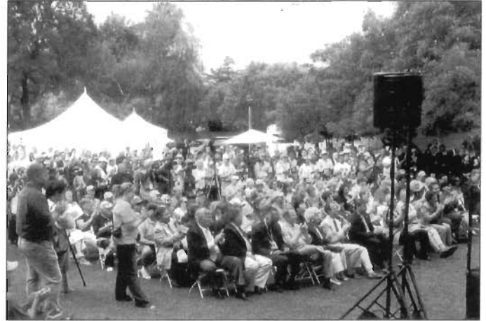
An audience of many people is seen, while loud speakers and a dignitary platform are to the right.