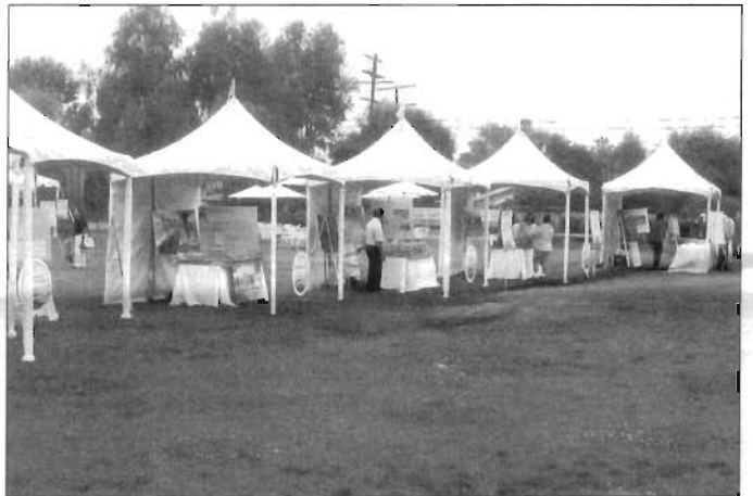
Groundbreaking for Phase 2A had small tents displaying different stations and news of related organizations, while large tents on the other side of the park clearing served refreshments of sandwiches, salads and drinks.