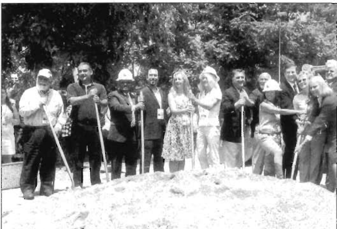
Groundbreaking occurred with many dignitaries moving sand with golden shovels in L-and-R photos.