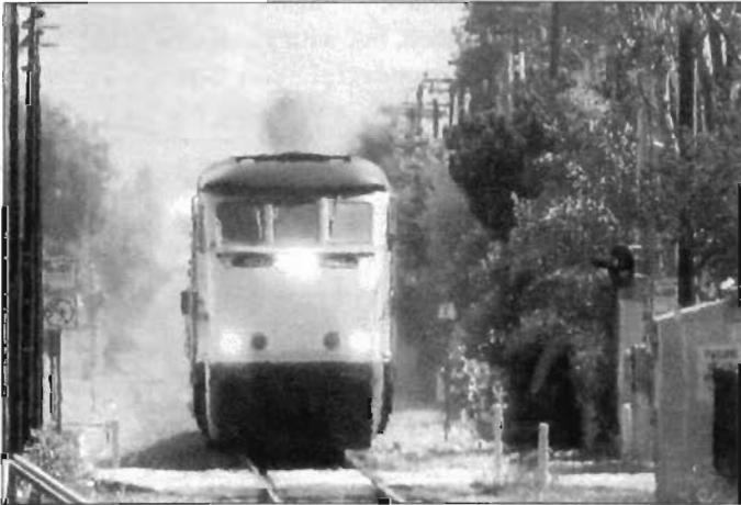
Train 366, bearing the PRS Metrolink Ramble Excursion, approaches the station at Baldwin Park on the afternoon of June 26, 2010. The apparent ripples in the photograph are heat waves on this hot early summer day.